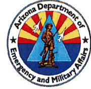
Major General Kerry L. Muehlenbeck THE ADJUTANT GENERAL

5636 East McDowell Road Phoenix, Arizona 85008-3495 (602) 267-2700 DSN: 853-2700