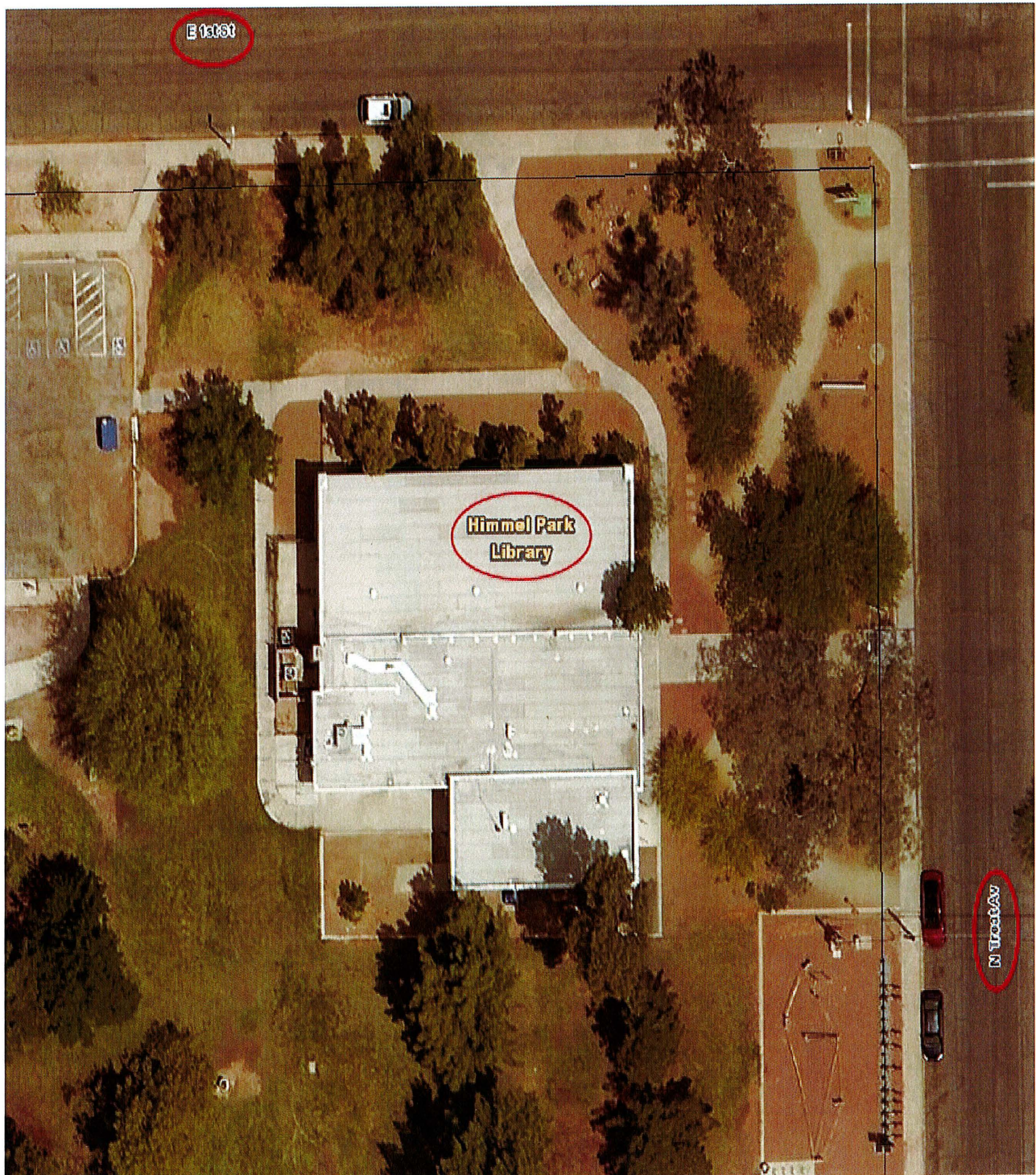
Himmel Park Library 1035 N. Treat Ave., Tucson, AZ