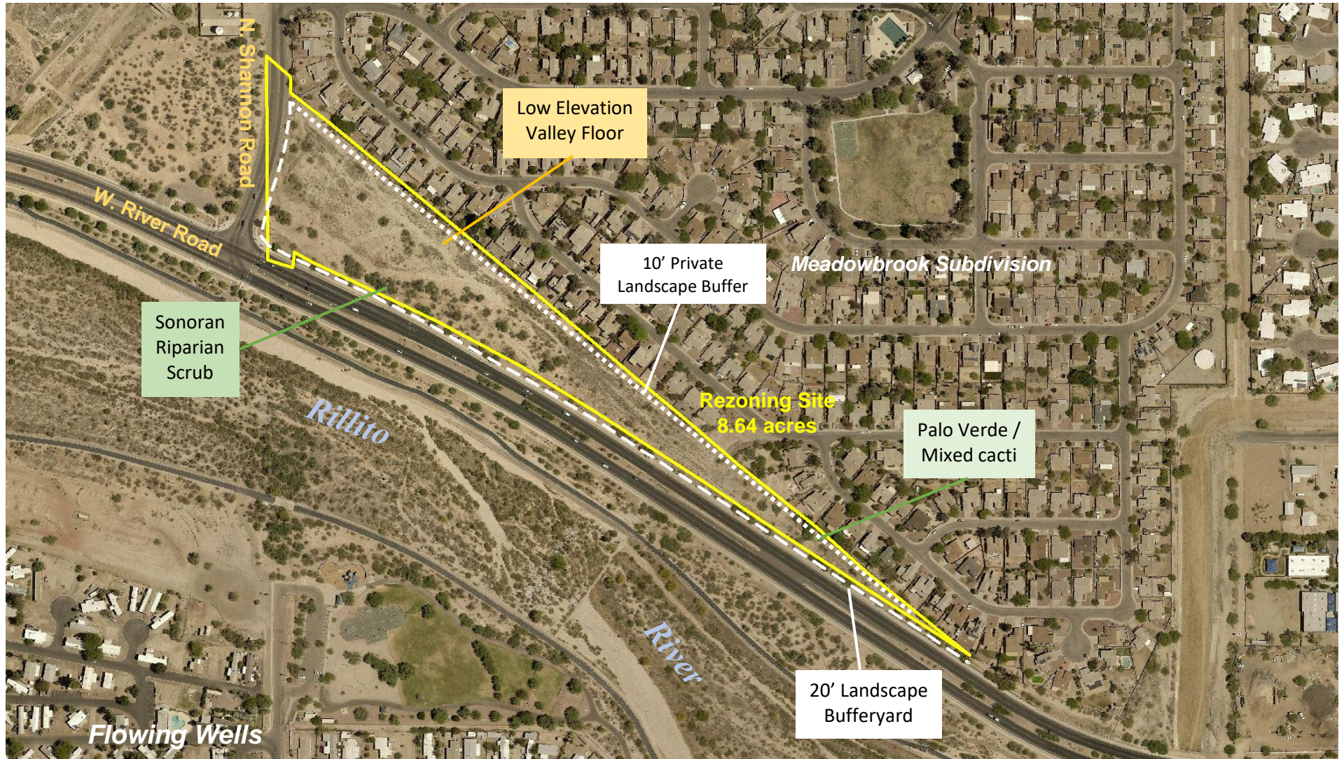
Exhibit I-D 2: Biological Resources [Vegetative Communities]