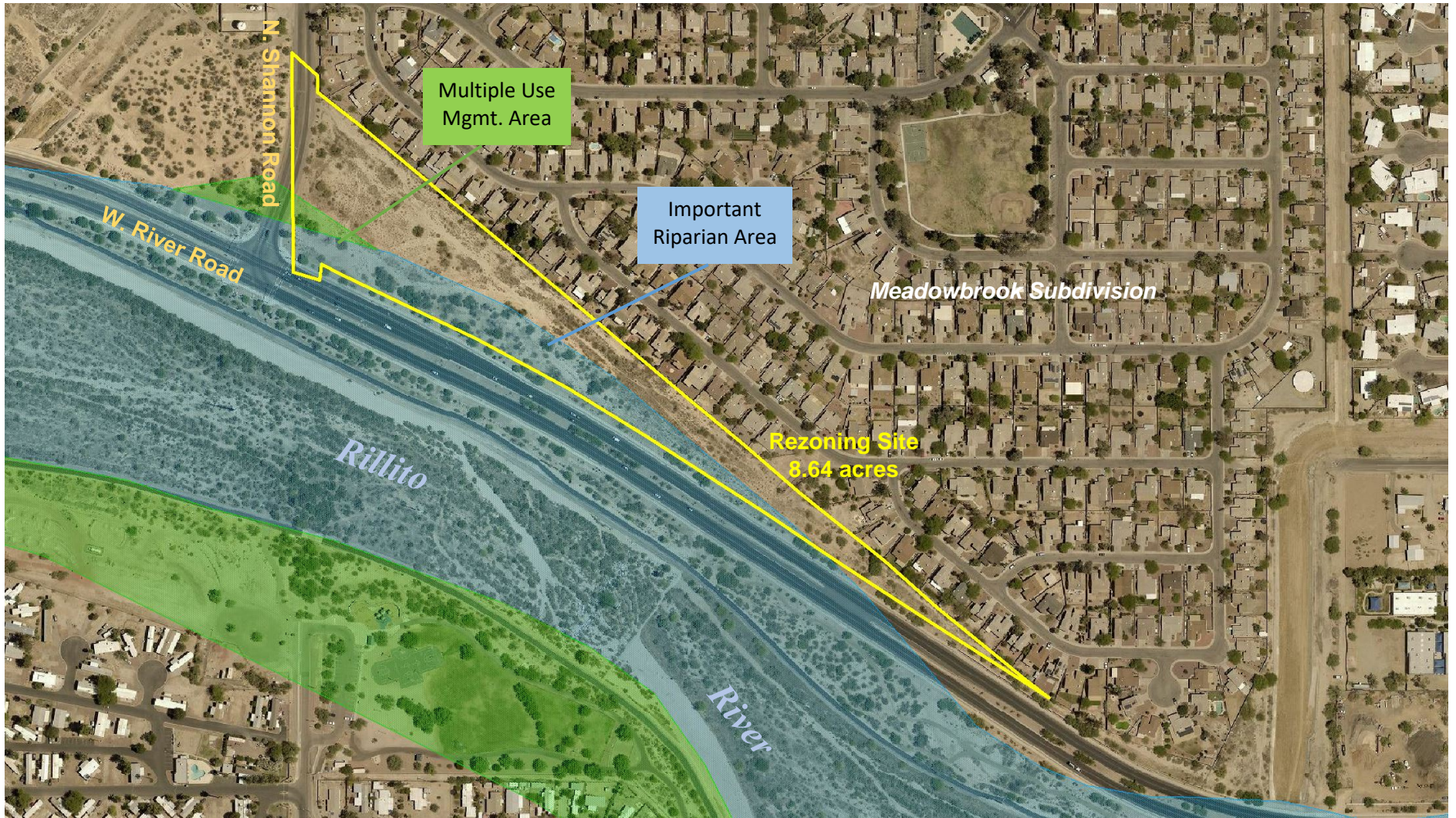
Exhibit I-D 1: Biological Resources [Maeveen Marie Behan Conservation Lands System]