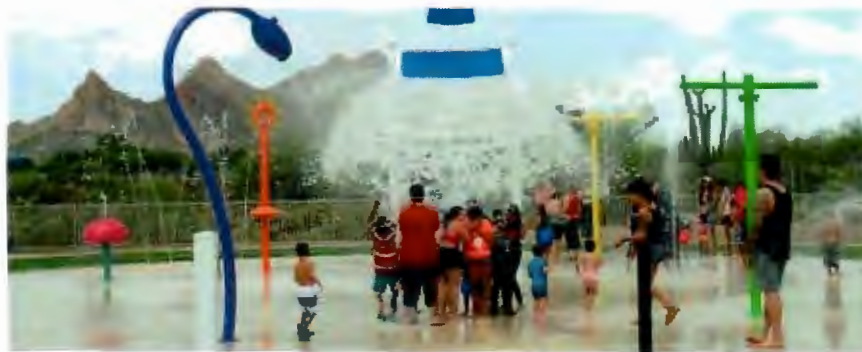
The Warden Family Splashpad at Manzanita Park was completed and open to the public on July 28, 2018. It is adjacent to the Manzanita Swimming Pool, utilizing existing parking lot and restroom infrastructure at the Drexel Heights Community Center and consists of a 60 foot diameter spray park with ground sprays and spray features, a 15 foot ring of natural grass encircling the pad, 4 covered ramadas, and associated support structures and equipment.

Since 1997, voters have authorized $1.52 billion in bonds. As of June 30, 2018, Pima County had sold all but 4 percent of the bonds over 27 individual sales. The remaining General Obligation bond authorization was sold on February 1, 2017. A portion of the County's share of Highway User Revenue Funds are used to repay the transportation bond debt, sewer fees are used to repay the sewer debt, and secondary property taxes are used to pay off the General Obligation bonds that fund the remainder of projects. Pima County bonds are sold with no more than a 15-year payback term. Pima County's conservative approach to debt management is reflected in its superior credit ratings and low interest rates.