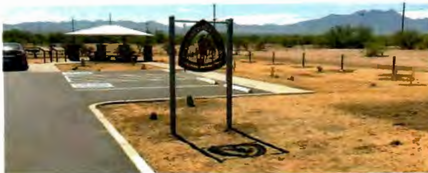
The Llano Grande Trailhead campsite commemorates the Anza Expedition of October 24, 1775. It is located along the west bank of the Santa Cruz River in Sahuarita. The trailhead includes vehicle parking, horse trailer parking, a shade ramada, and interpretive signage. The trailhead will be signed and marked by the beginning of October 2018, at which point the trailheads and trail will be open to the public.