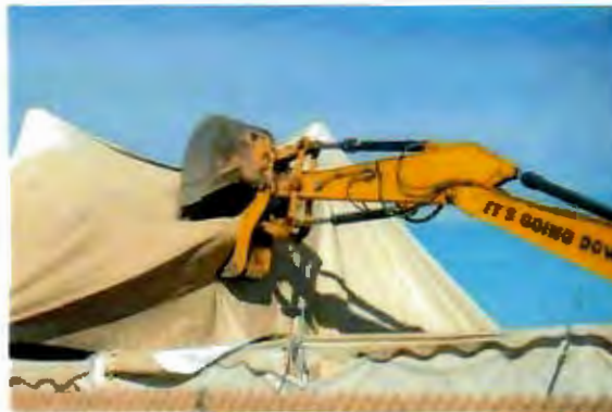
On June 29, 2018 the temporary dog housing tent, erected in 2014, was removed along with two modular buildings. These three structures were integral in allowing the Pima Animal Care Center to provide the necessary services until the new facility was completed. Their removal marks a new era in animal related services to the people and companion animals of Pima County.

Future Project Improvements to Town of Ajo Pima Animal Care Facility.