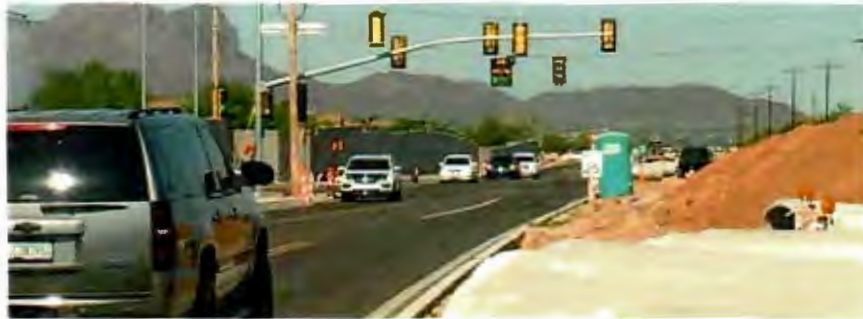
Highway User Revenue Funds (HURF) are funding the Cortaro Farms Road improvements.

While 1997 HURF revenue projects were originally planned for completion by Fiscal Year 2013/14, a lack of HURF revenues caused by the economic downturn, sweeps by the State Legislature and more fuel efficient vehicles, means that projects have taken longer to complete. For Fiscal Year 2017/18, HURF revenues to Pima County are projected to total approximately $61.6 million, and 40% are forecasted to repay debt for these transportation projects. Several projects are also reliant on Regional Transportation Authority (RTA) funding and scheduling. Three projects are managed by the City of Tucson.