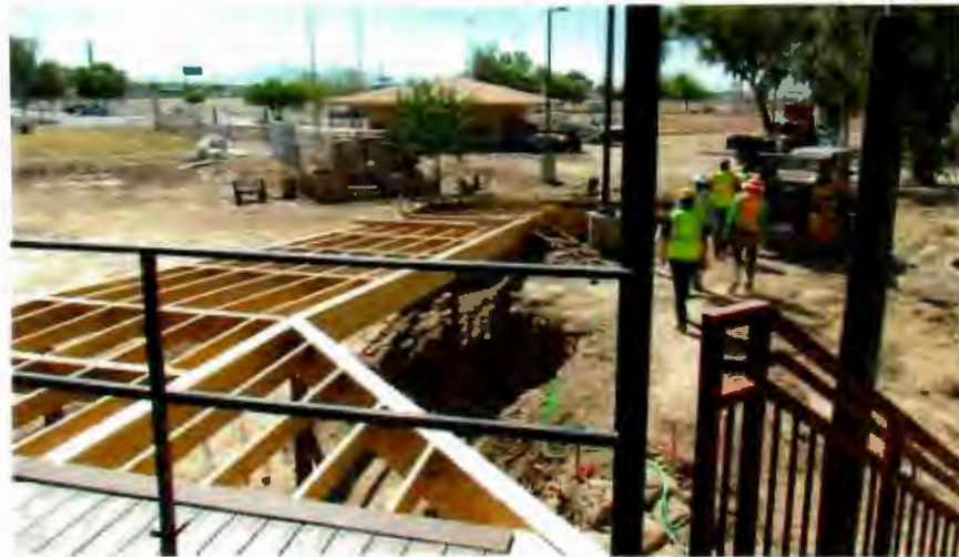
Bond funds were used to upgrade the 50-acre Mike Jacob Sports Park, including work to renovate the restrooms and ticket facilities, the addition of accessibility features such as ramps and railings and improvements to the existing irrigation system.