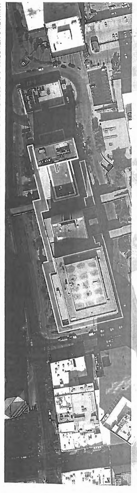
JANUARY 8 MEMORIAL & EL PRESIDIO PARE MASTERPLAN. TUCSON • CSAO RMS agl JK • 2016