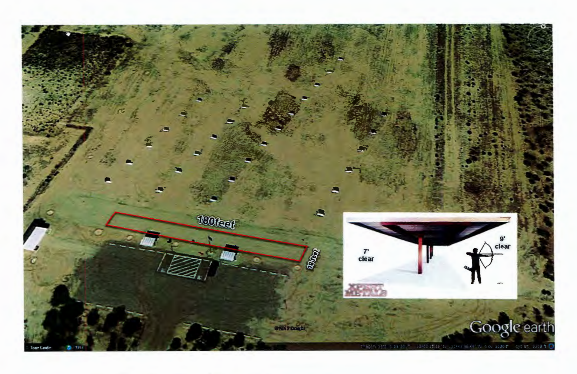
Attachment A: Archery Range Shade Canopy Site Layout and Structure Design.