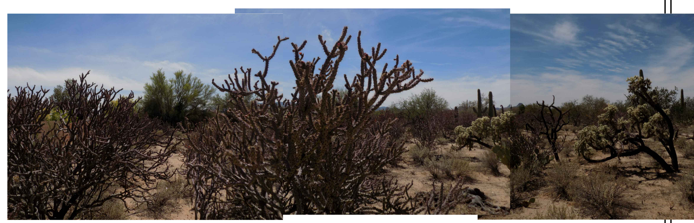
PHOTO LOCATION 7: View from east midpoint of the project, looking west.