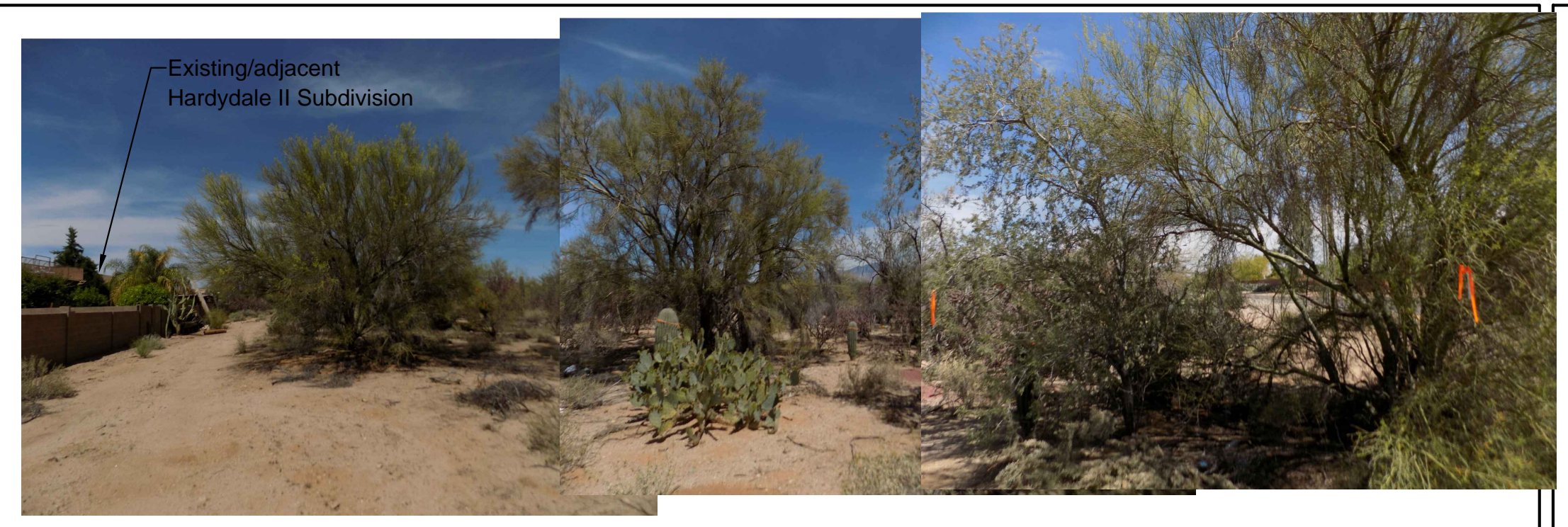
PHOTO LOCATION 5: View from southwest corner of the project, looking northeast at the property.