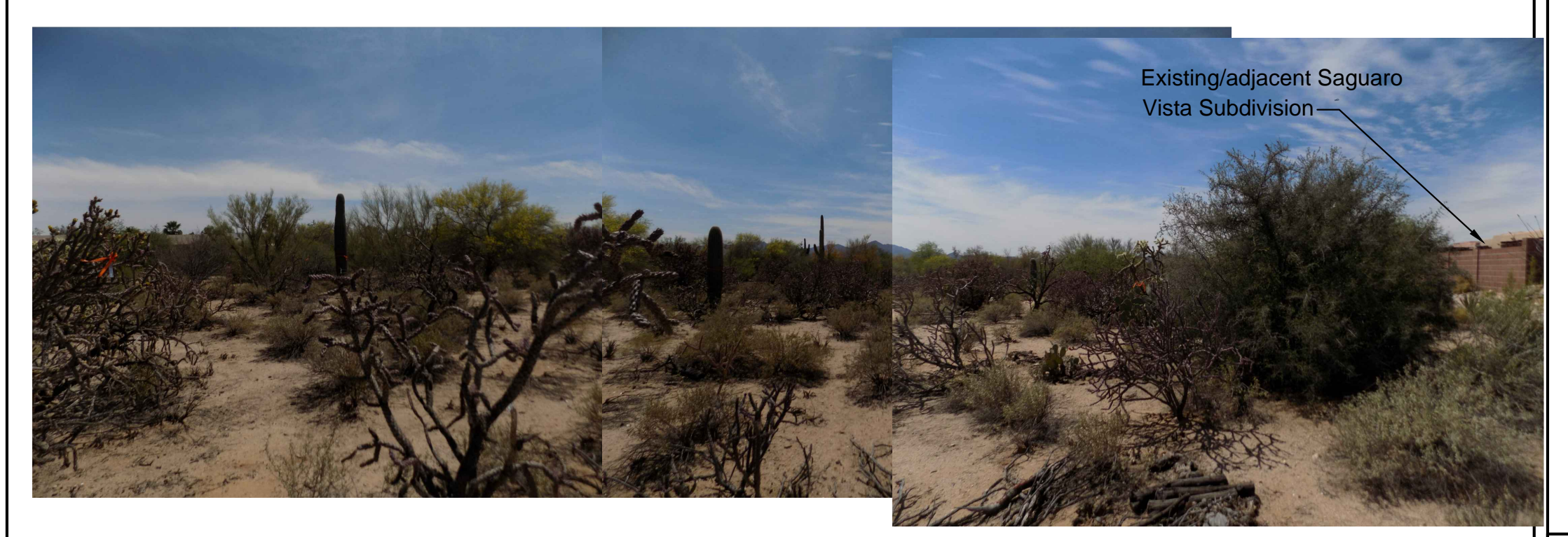
PHOTO LOCATION 2: View from northeast corner of the project, looking southwest at the property.