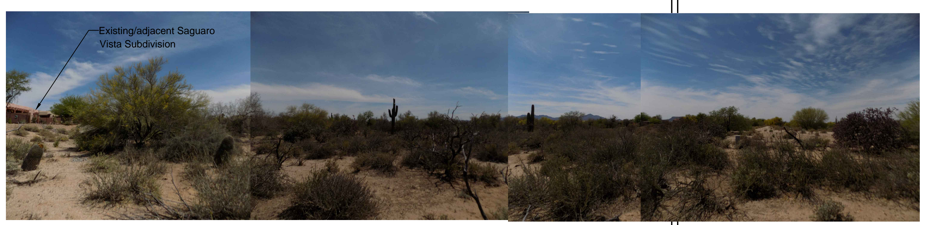
PHOTO LOCATION 3: View from north midpoint of the project, looking south toward Hardy Road.