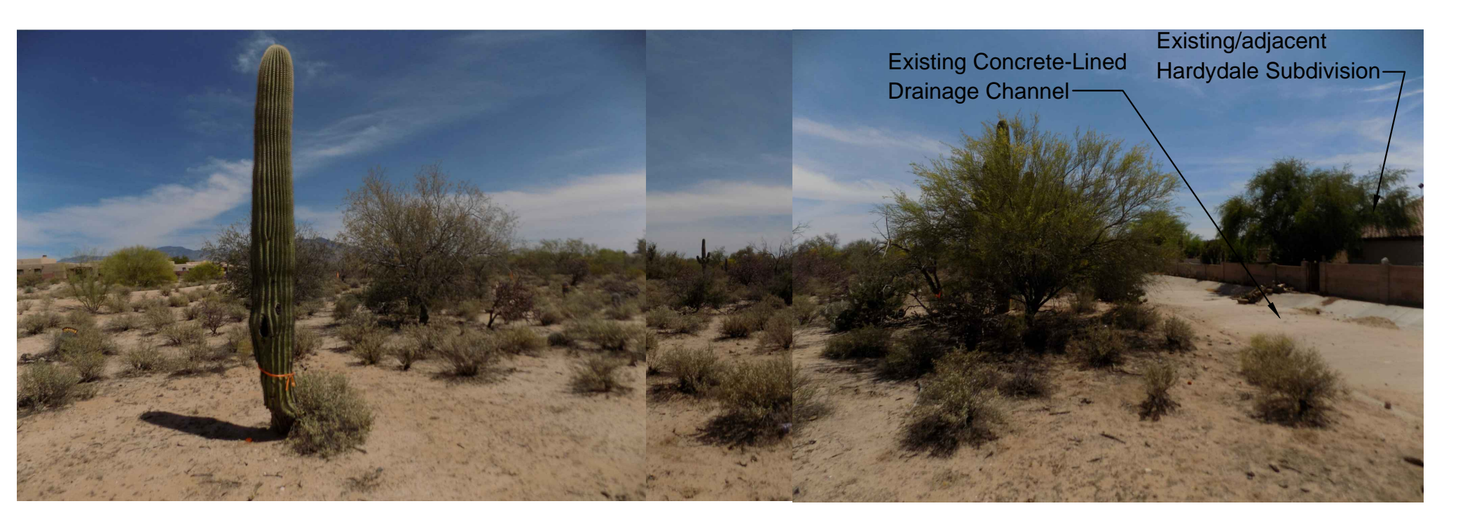
PHOTO LOCATION 1: View from northwest corner of the project, looking southeast at the property.