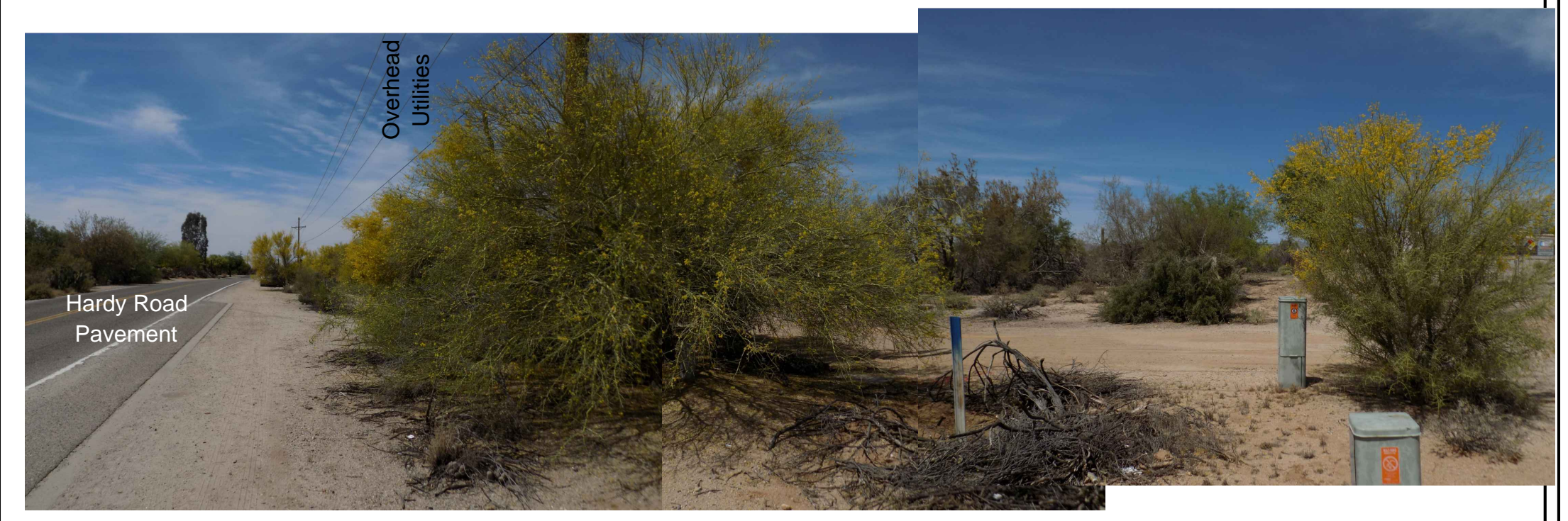
PHOTO LOCATION 6: View from southeast corner of the project, looking northwest at the property.