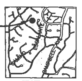
SECTION 08 G&SRM PIMA COUNTY, ARIZONA