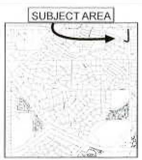
SECTION 05 G&SRM PIMA COUNTY, ARIZONA

SECTION 05 TOWNSHIP 13 SOUTH RANGE 14 EAST