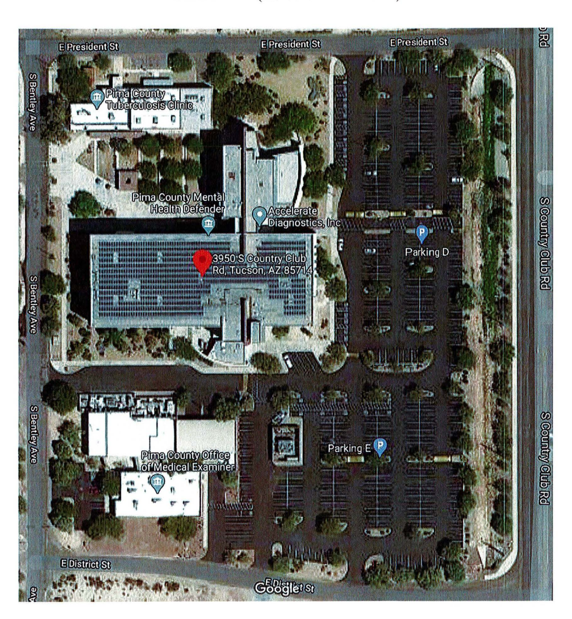
EXHIBIT A SITE PLAN (Parcel shown in blue)