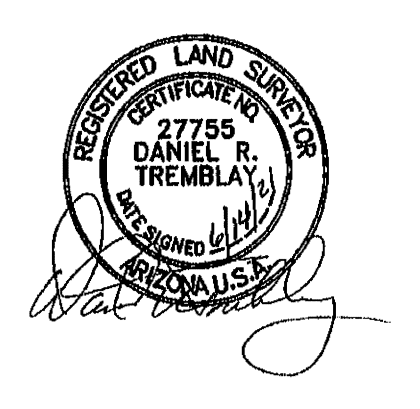
Pg. 1 of 2

Further excluding all that portion of that parcel as described in Docket 12427 at Page 3919.