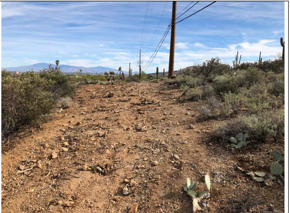
Photo Description: Central access road after stabilization looking east.