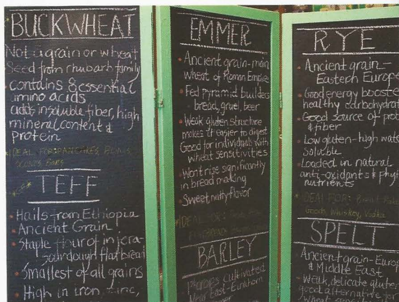
Below: Chalkboards list some of the grains the Hunttons grow and sell at their store.