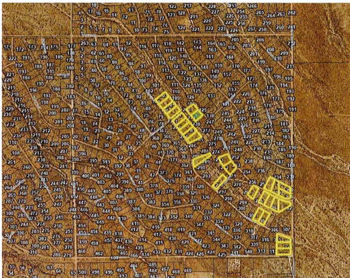
EXHIBIT "A" (continued)