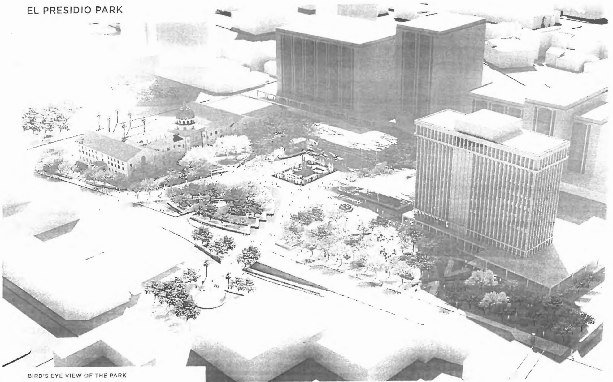
BIRD'S EYE VIEW OF THE PARK