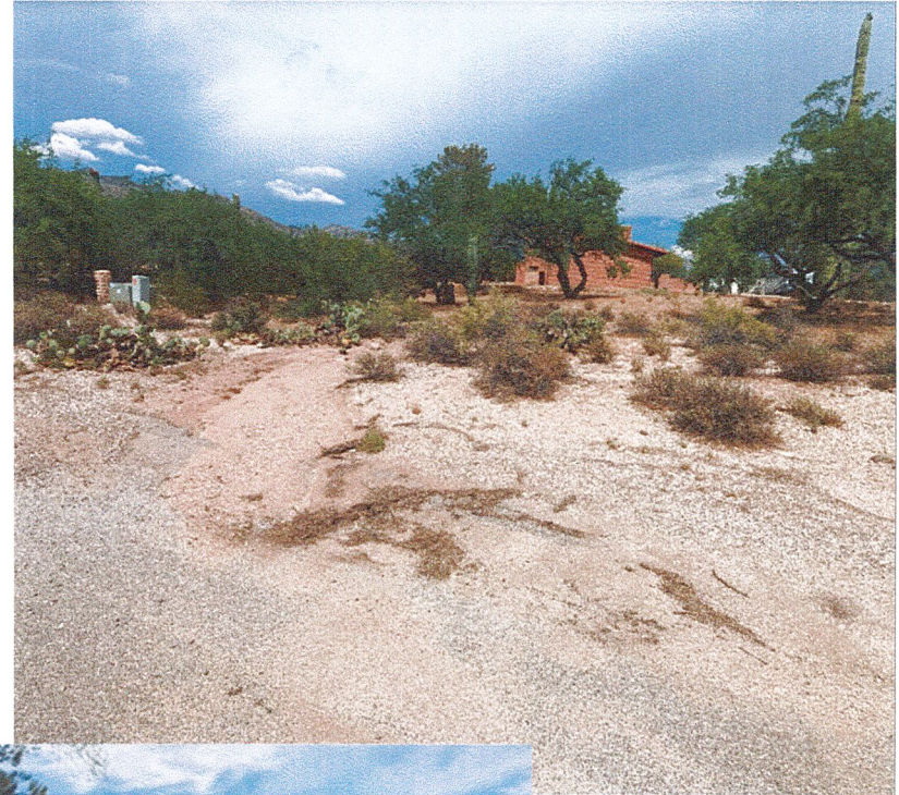
#2 – Wohlford property