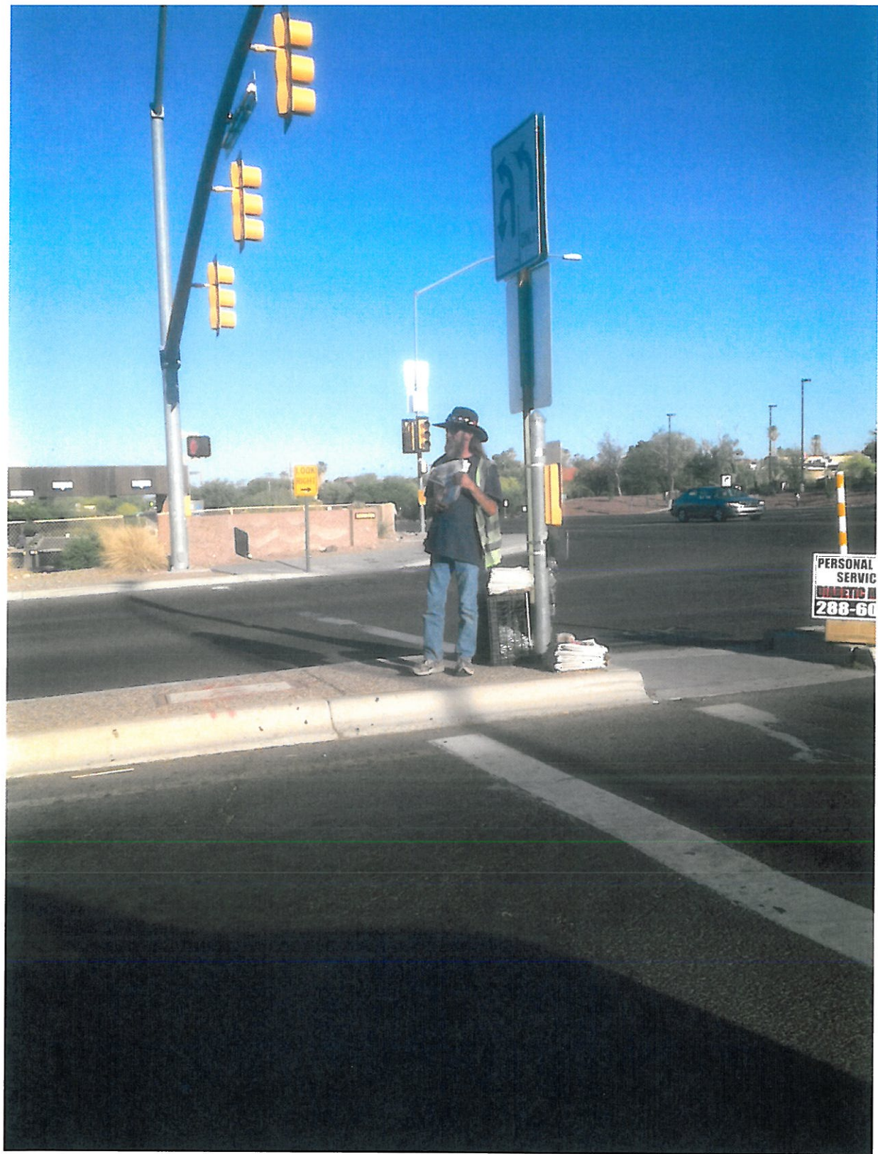
Swan and Sunrise