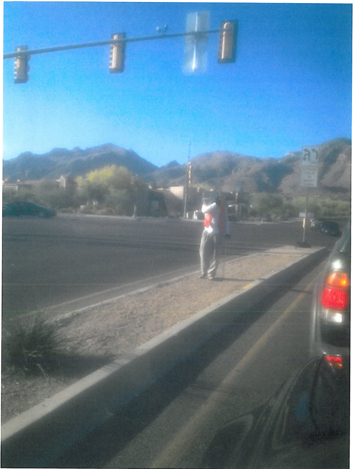
Campbell and Sunrise