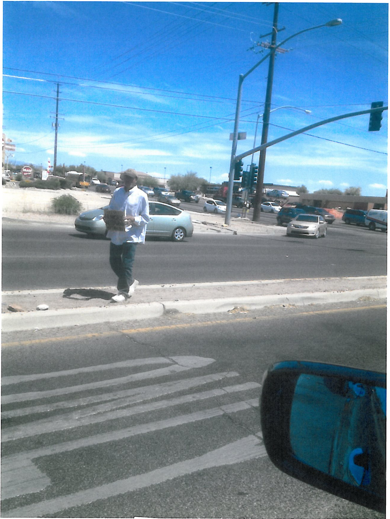
INA and CRACLE