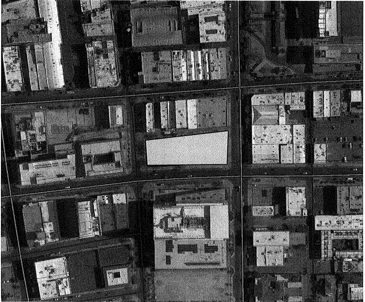
Exhibit A, Cont. Location of Broadway Property