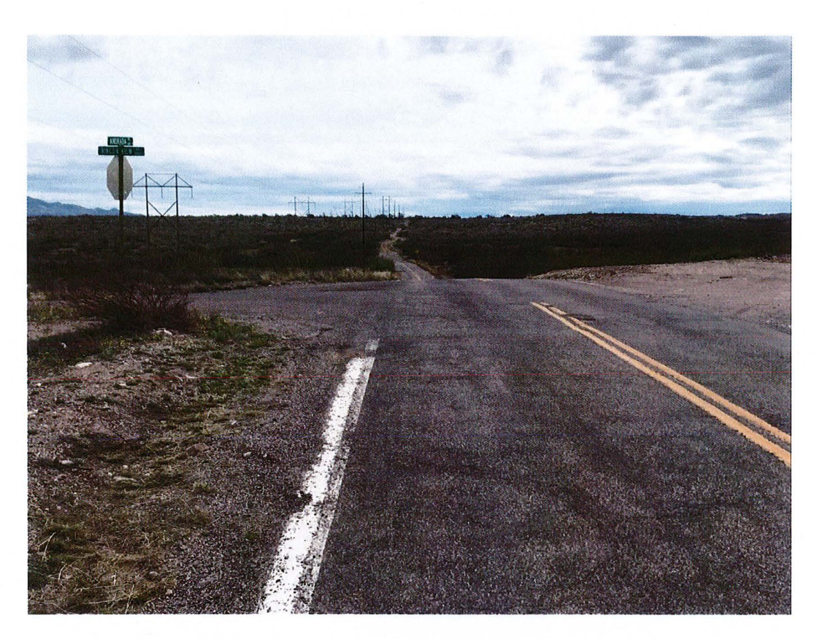
LOOKING EAST ON ANDRADA ROAD