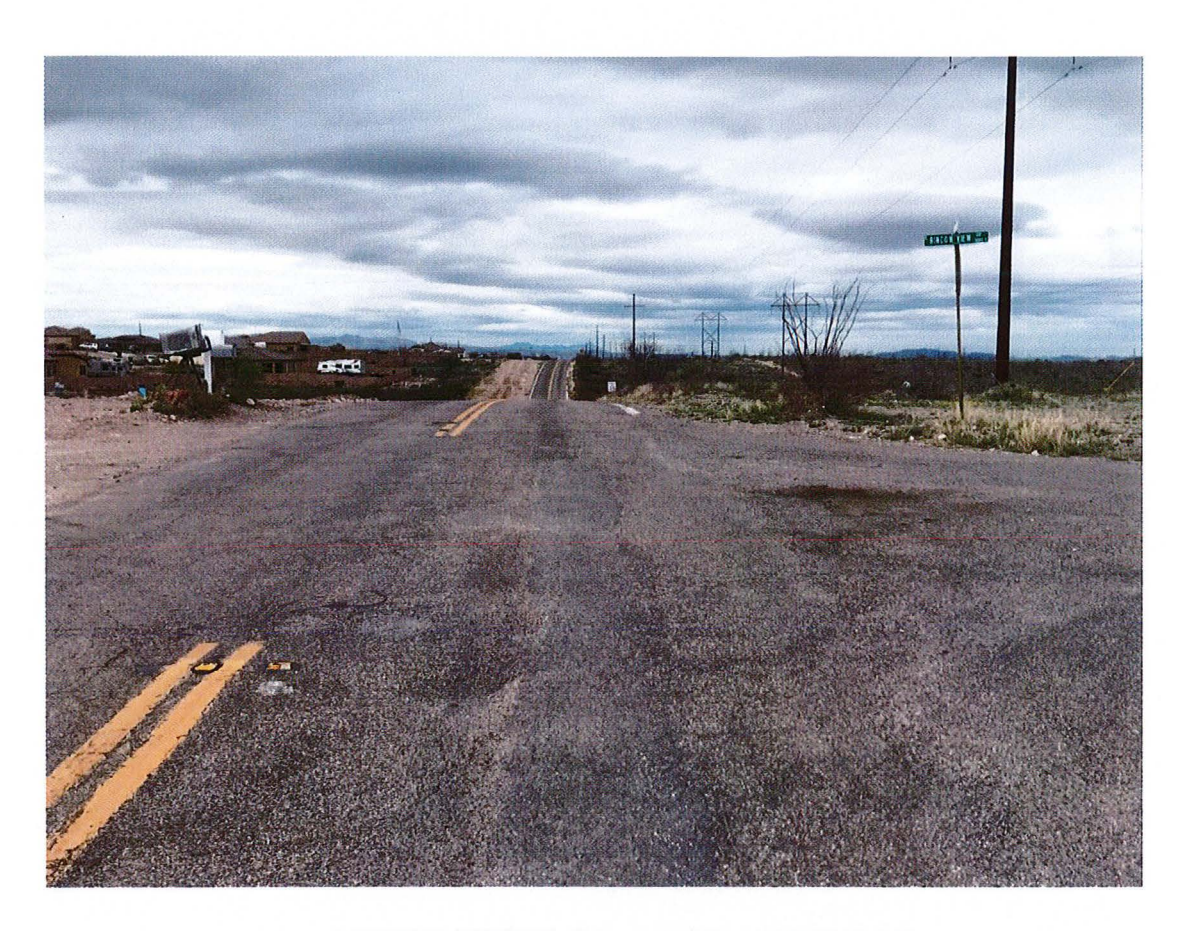
LOOKING WEST ON ANDRADA ROAD