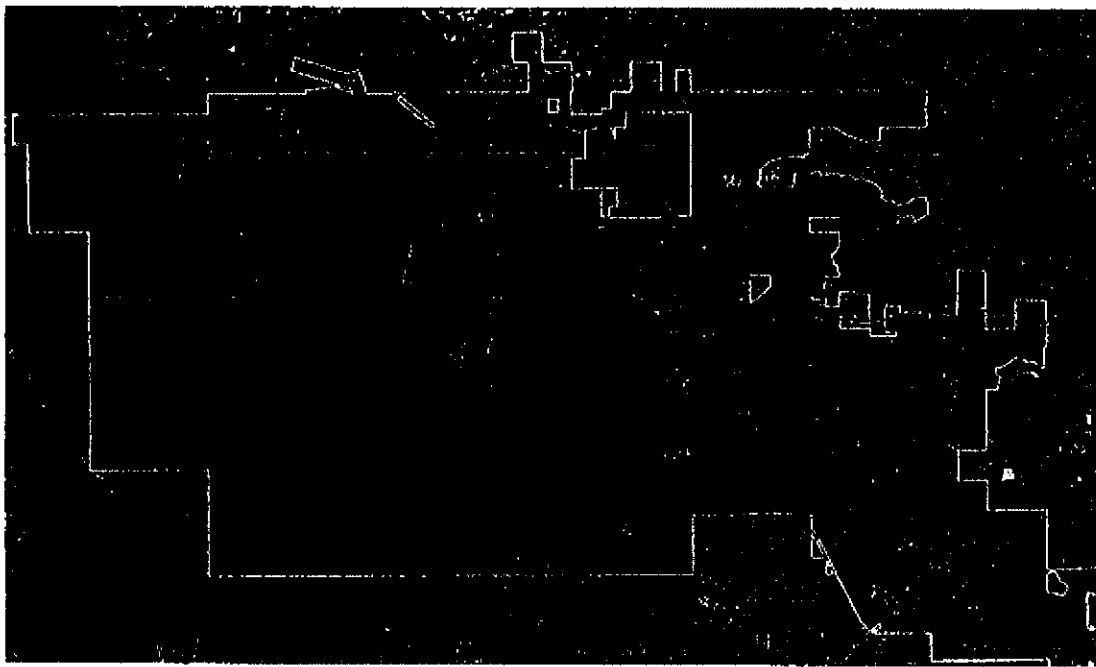
Figure 1. Mine locations to be fenced at Tucson Mountain Park.

accidental entrance into these features. While onsite, AZGFD biologists will assess each mine feature as potential bat or other wildlife habitat. We will be able to eliminate features that provide no habitat, so a future survey with additional funding will be able to assess the remaining mines as potential habitat through scoping and/or emergence counts. The size of the fence that will be installed around a mine feature is determined by the size of the collar. A hypothetical mine feature with a 10-foot collar would get a 20x20 foot fence installed around it. The fence would roughly consist of 14 T-posts, 450' of smooth wire, 12 stays, and 32 fence clips. The fence will be constructed with four corner T-post, and two support T-post in between each corner. We will also use two T-posts as anchor's opposite each other to keep appropriate tension on the wire. Fences will be signed on sides visible to the public.