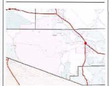
Map of Treasurer's Deed Parcel