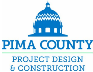
EXHIBIT A - SCOPE OF SERVICES (13 Pages) REVISED 01/28/26