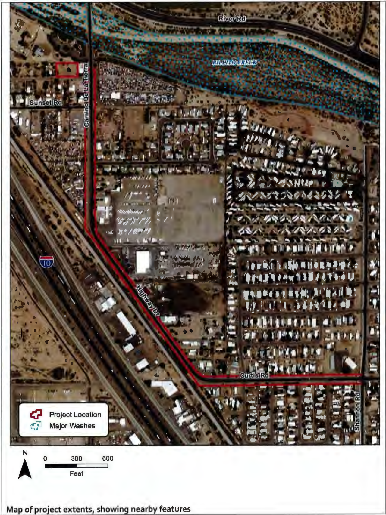
Map of project extents, showing nearby features